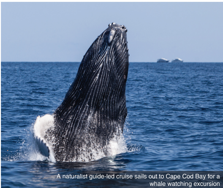
A naturalist guide-led cruise sails out to Cape Cod Bay for a whale watching excursion

DAY 9 Travel Home: This morning, take the group transfer to Boston's Logan Airport for flights out after 12:00 p.m. Meal: B