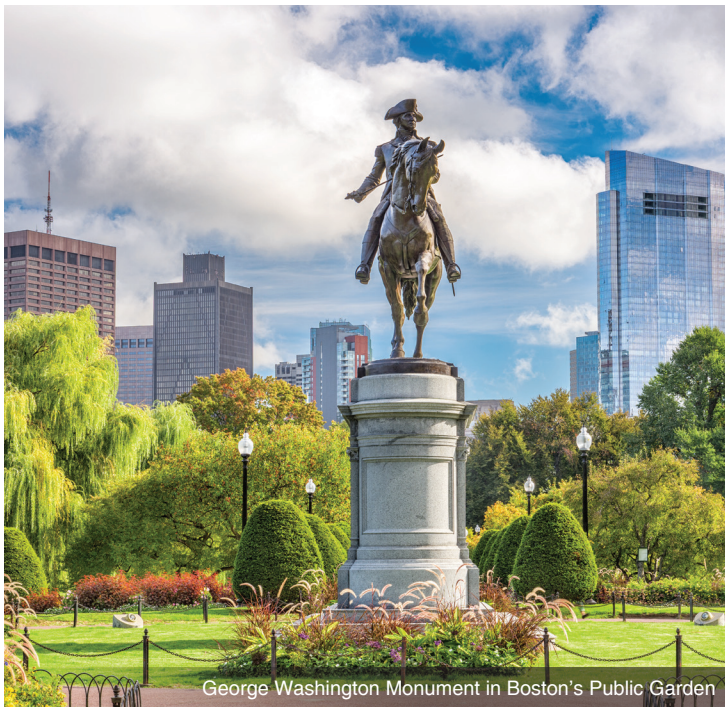
George Washington Monument in Boston's Public Garden