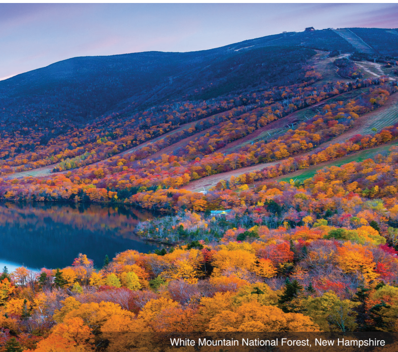
White Mountain National Forest, New Hampshire